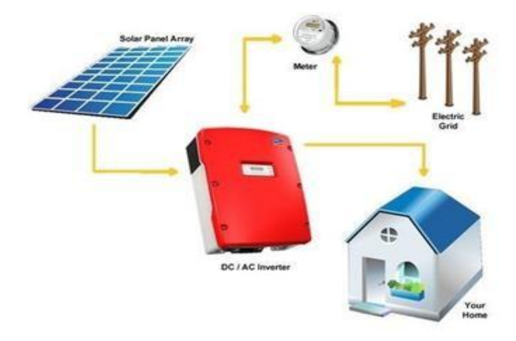
Figure 3: Flow of Solar Power