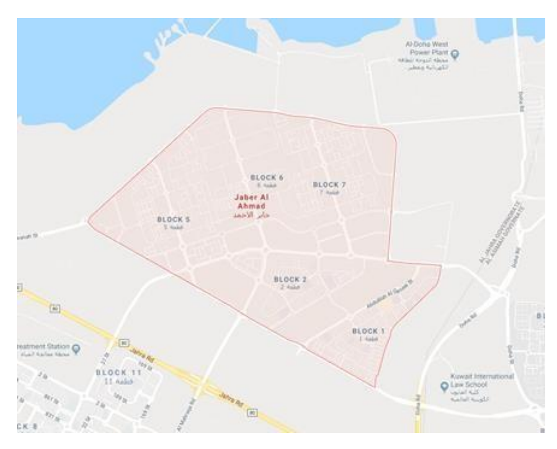
Figure 2: Jaber AlAhmad Area