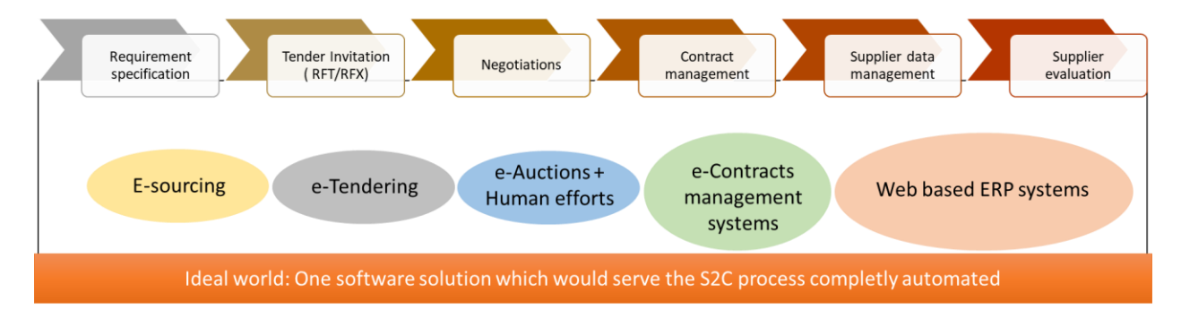
Figure 4: One software solution for the whole Tactical Procurement process

The ideal solution would be to automate the whole S2C process with one software solution, which could be then connected with the P2P process as well and this whole process, the companies have who want to embrace digitization should think of one solution which could not only automate the tactical procurement but rather the whole procumbent as one.