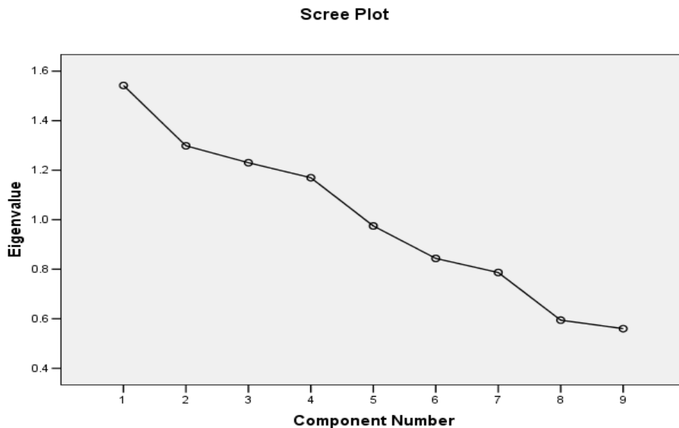
Figure 2: Scree Plot for aspects of Organizing

The scree plot is a graph of the eigenvalues against all the factors considered. The graph was useful for determining how many factors on organizing to retain. The point of interest is where the curve starts to flatten (the Elbow) and where the eigenvalue is below 1.