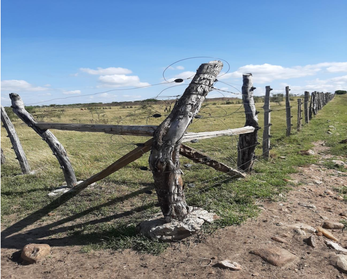
Figure 1 An electric fence on a private property to block animals