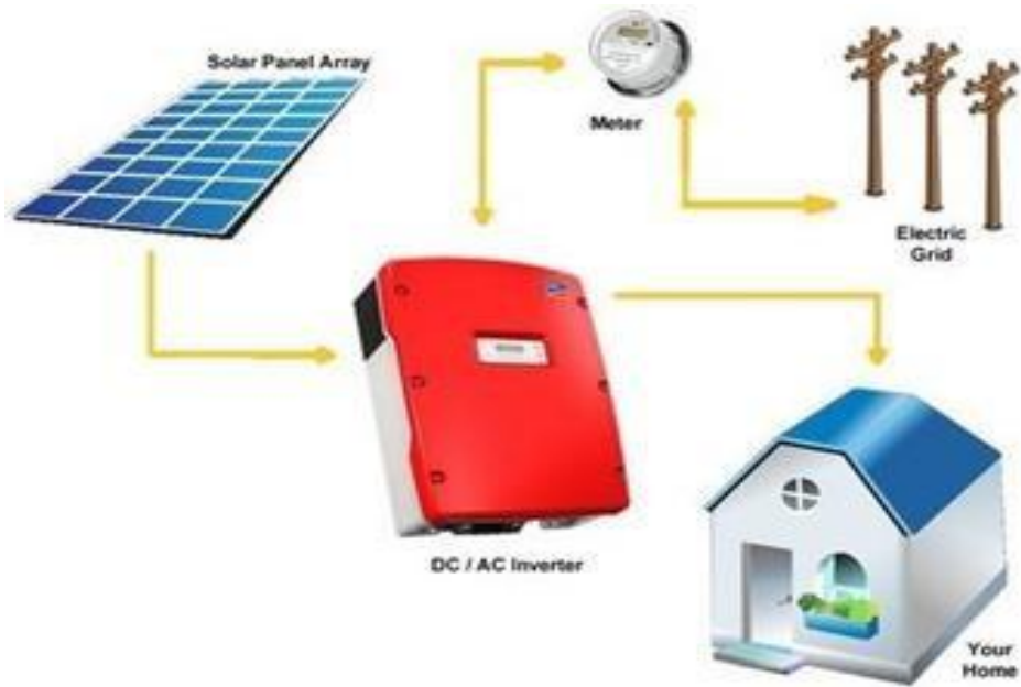
Figure 3: Flow of Solar Power