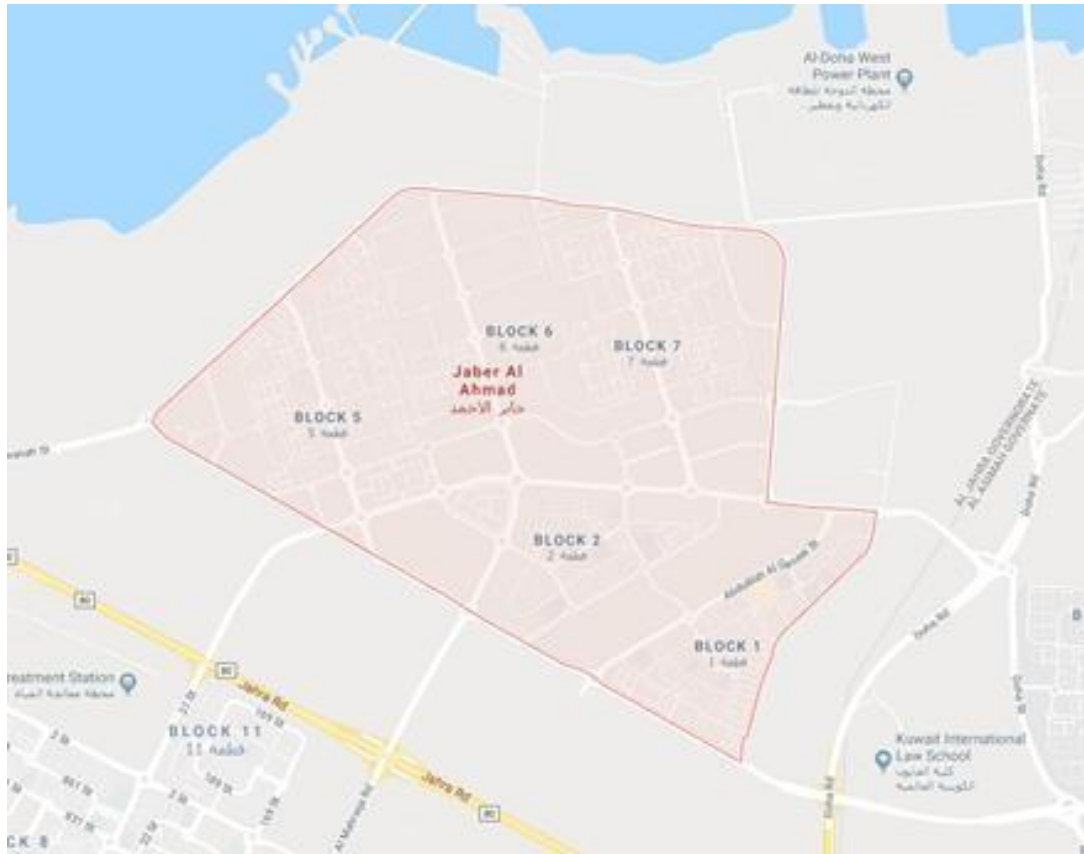
Figure 2: Jaber AlAhmad Area